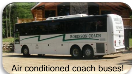
Air conditioned coach buses!

*cost includes a $20 special activity fee