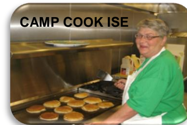
CAMP COOK ISE