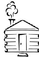
Damascus Health Center