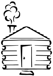
Camp Office & Staff House

Sand Volleyball Court, Basketball Court, Softball field, Rainbow Play set