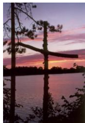
Outdoor Worship area